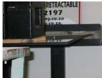
SABS Testing on Balustrade Glass