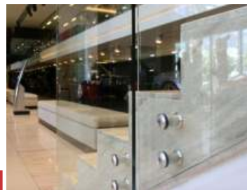
Best Grade Aluminium