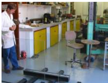
SABS Tested Products